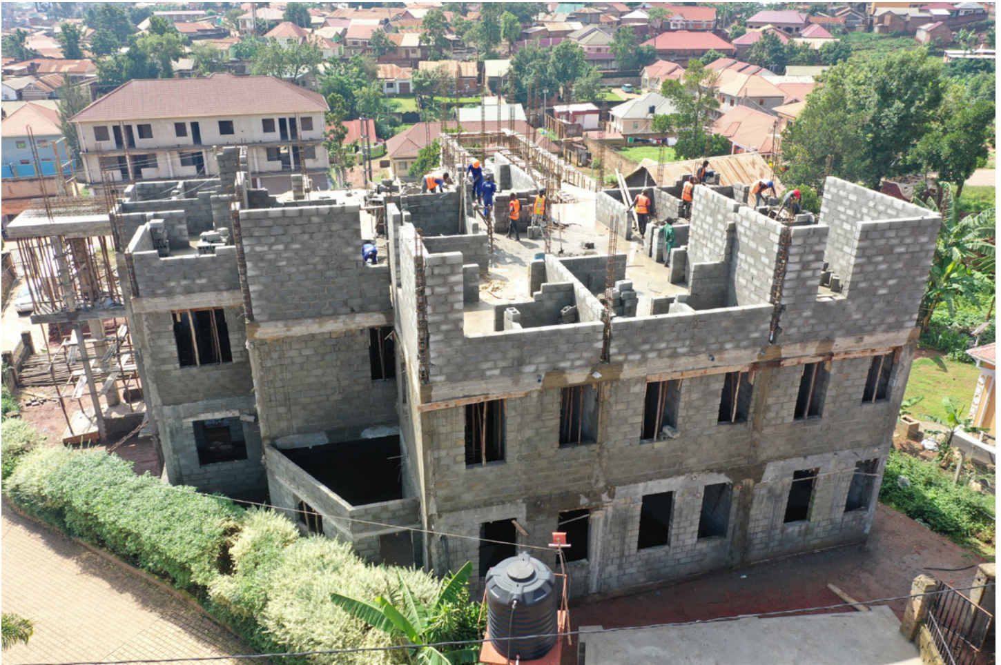
The Gary Holmes Hospital is making good progress in the construction of the three-story Lee and Penny Anderson Inpatient Center of Excellence, which will provide 11,602 square feet of much needed space for the hospital's fastest growing program: maternal health services.