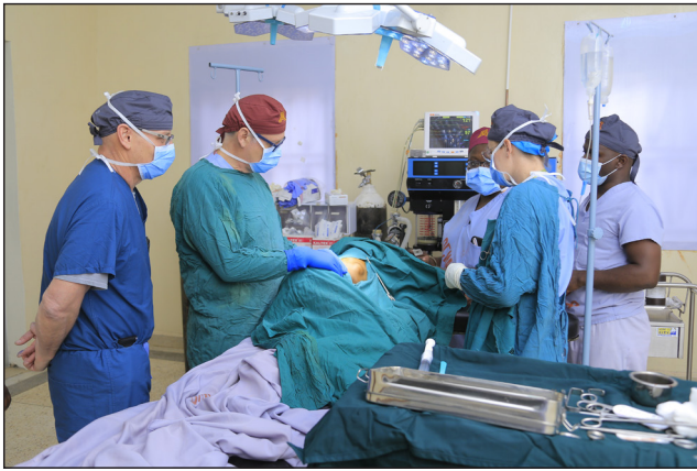
Photos taken in the operating rooms during the ongoing surgery camp.

age. After the screening, it was determined that 75 people were eligible for procedures to fix hernias and excision of subcutaneous masses. The surgeons conducted surgeries from April 24th to 28th, and from May 8th to 12th in which about 60 procedures were completed. The U of M team comprised of three surgeons, three anesthesiologists, three surgery residents and two anesthesiology residents.