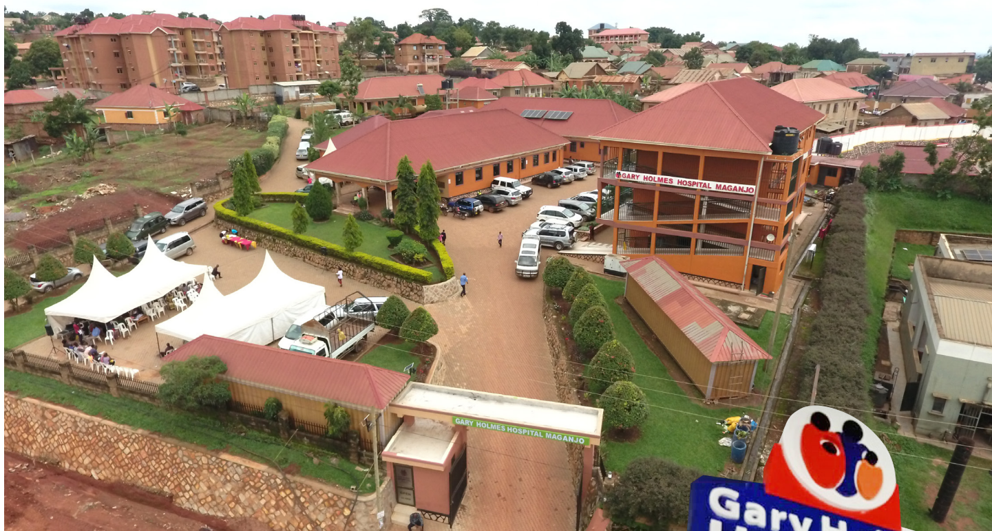
▲ AERIAL PHOTO OF GARY HOLMES HOSPITAL MAGANJO

On February 18, 2023, I had the pleasure of joining the Ugandan community in celebrating the 10-year anniversary of the Gary Holmes Hospital Maganjo, formerly known as the Ruth Gaylord Hospital Maganjo. I was asked repeatedly to convey to you, the hospitals sponsors and benefactors, how deeply grateful they are for this miracle of affordable, high quality health care. In 2022 the hospital logged over 50,000 patient visits, administered over 900 immunizations and recorded 608 deliveries. Thank you!