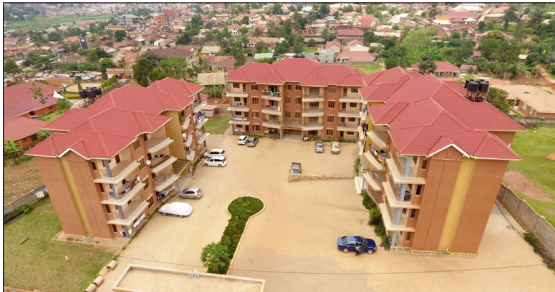
▲ Leased area comprising the seven hospital buildings plus the three residential apartment buildings.

Our thanks and appreciation for your generosity.