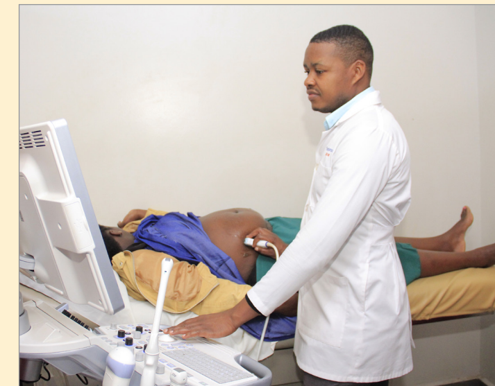
▲ This 27-year-old was getting an ultrasound scan on a routine antenatal care visit. At 19 weeks of pregnancy, everything was going on well.

And let us not grow weary of doing good, for in due season we will reap, if we do not give up. So then, as we have opportunity, let us do good to everyone, and especially to those who are of the household of faith.