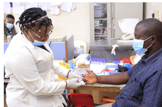
▲ This 34 year old came in with persistent joint pain, feeling feverish and a headache. He was diagnosed with malaria and put on anti-malarial medication.